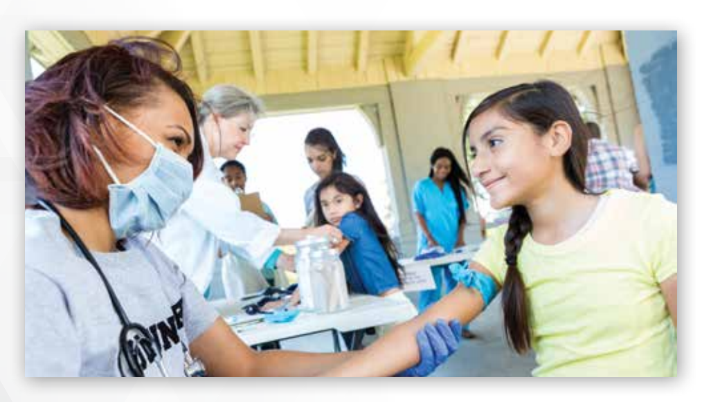
☑ Read about our sustainability efforts.