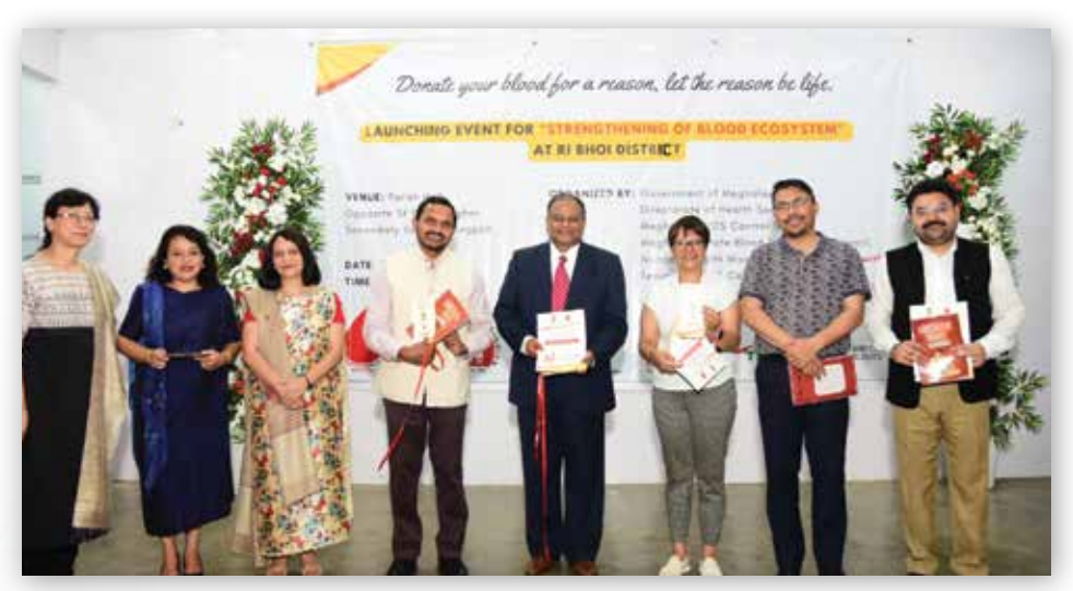
☑ Browse news and events information.