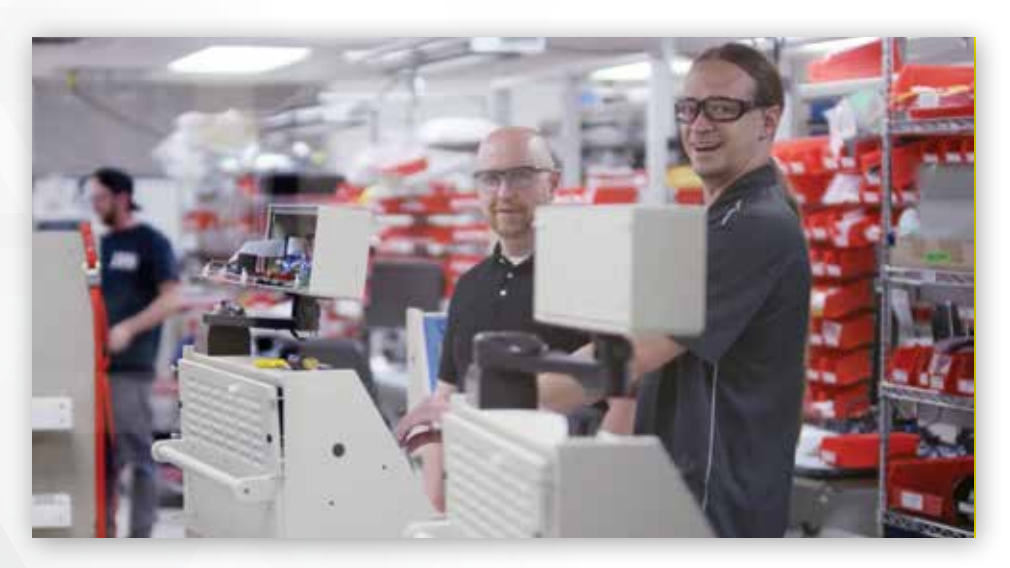
Learn about life as a Terumo Blood and Cell Technologies associate.