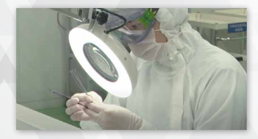
Description Learn more about Terumo Corporation.