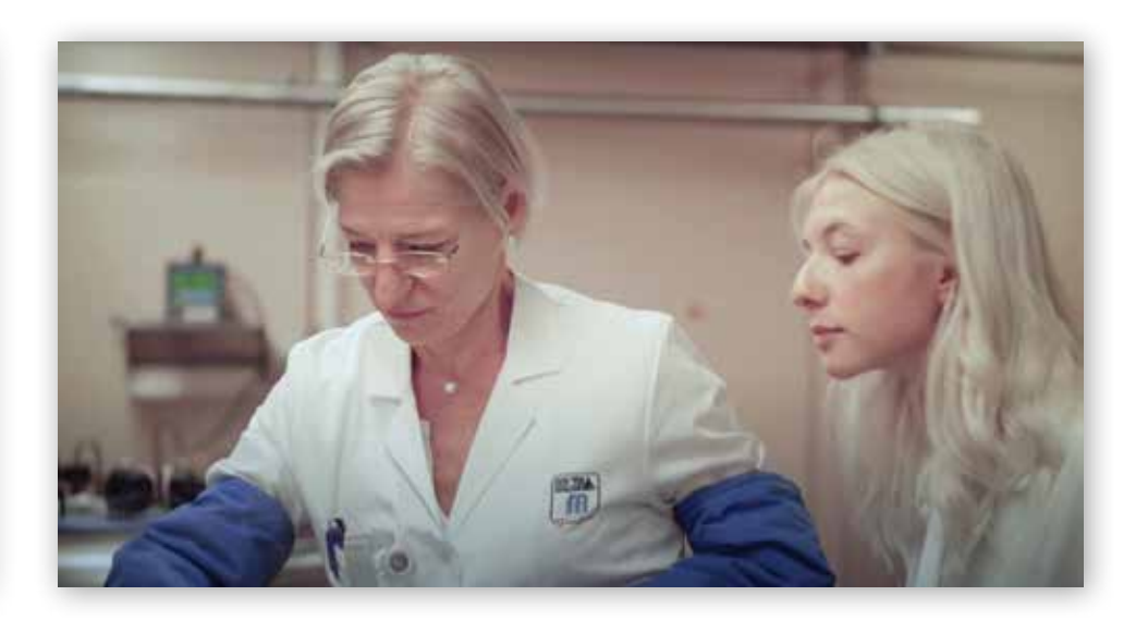
▶ Hear a heartfelt success story highlighting stem cell transplants, presented by MedTech Europe and produced by BBC StoryWorks Commercial Productions.