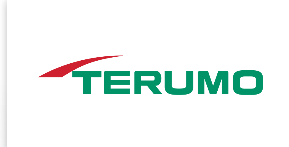
☑ Visit the Terumo Global website.